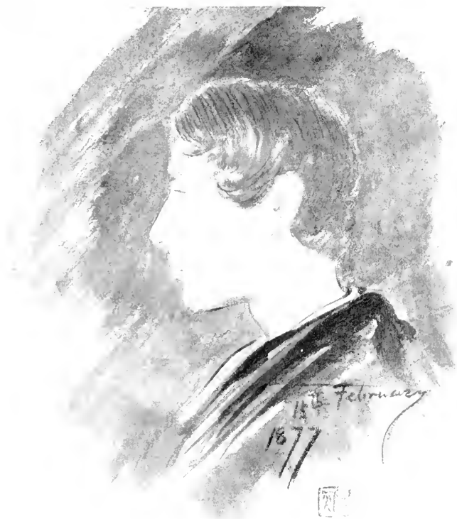
TAGORE IN 1877